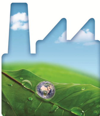
Learn the GREEN way

EU has introduced a directive (Directive 2009/28/EC) for the support of renewable energy sources, demanding the increase to the consumption of energy from renewable sources to approximately 20% by 2020.